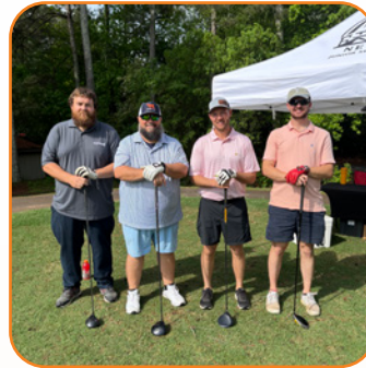
NJSL Golf Tournament