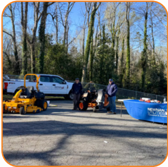
Atkinson Career Day