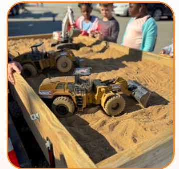
White Oak Career Day