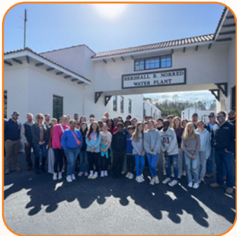
Madras Water Plant Tour