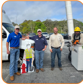
Elm Street Career Day