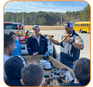
Madras Career Day