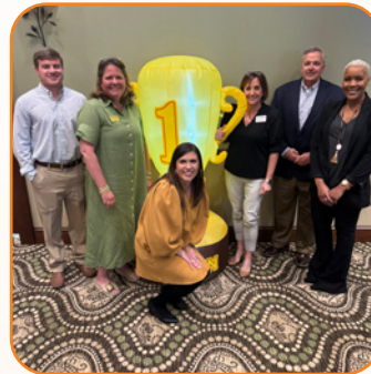
State of the Chamber Luncheon