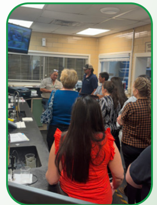
Coweta Water Education Team Tour