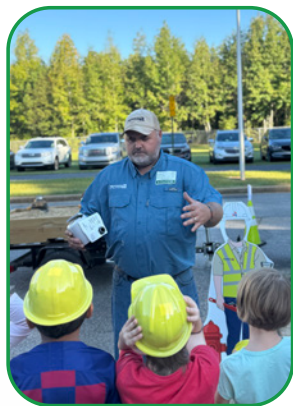
Arbor Springs Career Day