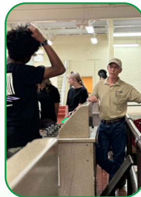
Newnan Youth Council Tour