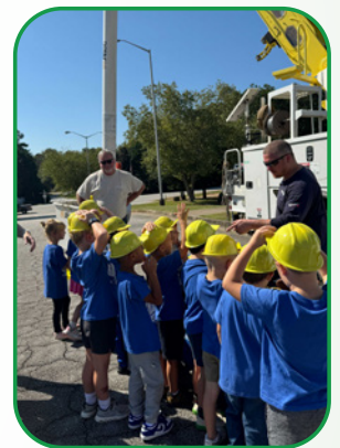
Canongate Career Day