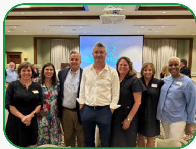
Forward Coweta Summit