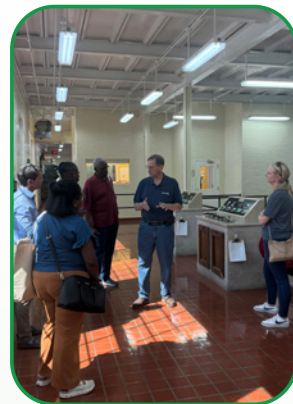
Newnan Citizen Academy Tour