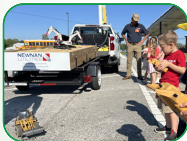
Western Career Day