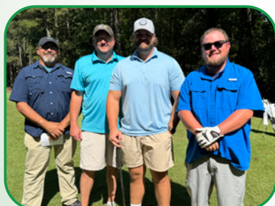
Newnan-Coweta Habitat for Humanity Golf Tournament