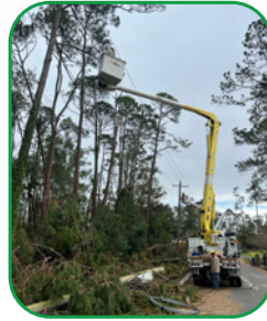
Hurricane Helene Douglas, GA